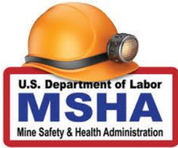
MSHA Updates MSHA SE District Office