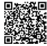
Android App Store

On your computer, tablet, or phone go to: https://event.crowdcompass.com/semshc [event.crowdcompass.com]